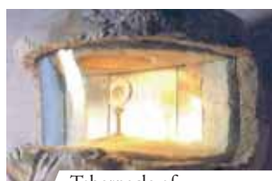
Tabernacle of the Eucharistic miracle