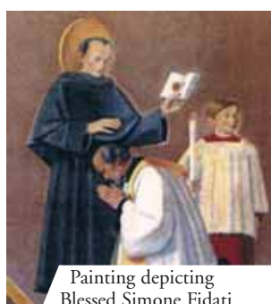
Painting depicting Blessed Simone Fidati