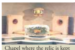
Chapel where the relic is kept in the Lower Basilica