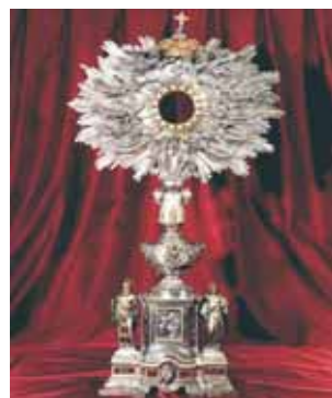
Ancient monstrance which contained the relic of the miracle