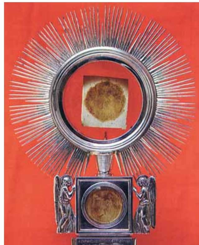
Relic of the Eucharistic miracle