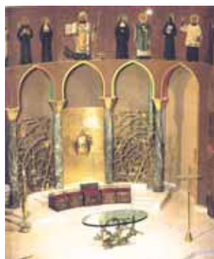
Upper Basilica with presbytery by the sculptor Manzu