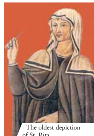
The oldest depiction of St. Rita