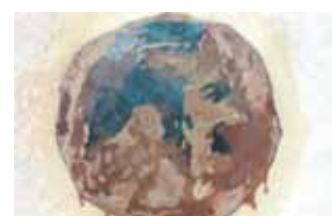
Enlarged reproduction of the face which appeared in the left-hand page