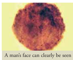
A man's face can clearly be seen