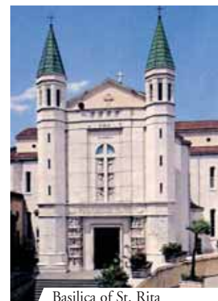
Basilica of St. Rita