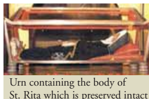
Urn containing the body of St. Rita which is preserved intact